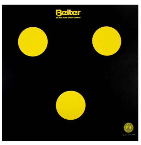
HM360P Beiter Hit-Miss Paper Target 3x60mm

HM6040 Beiter Hit-Miss, Target 3x60/3x40mm, 290x290x50mm HM4020 Beiter Hit-Miss, Target 3x40/3x20mm, 290x290x50mm