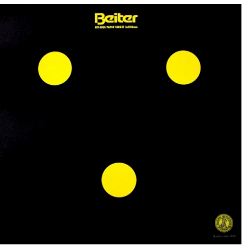
HM340P Beiter Hit-Miss Paper Target 3x40mm